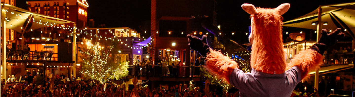
CHART A COURSE TO DURHAM